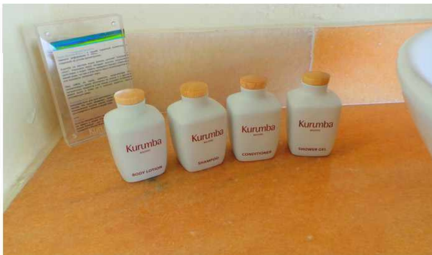
Molton Brown toiletries. Kurumba Maldives

The bathroom gave a feeling of walking into a small spa. 2 sinks, a stand alone bath tub and 1 outdoor shower, and 1 indoor.