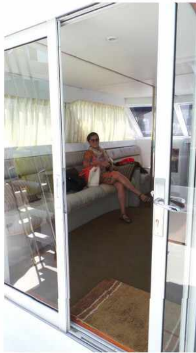
Kurumba Speedboat transfer

Nothing short of splendid and convenient. Kurumba is less than 10 minutes by speed boat from Male Airport. This feels like cheating, really. Paradise in less than 10 minutes, when others need to fly , hop, and skip by seaplane, domestic flights and boat to get to their resorts.