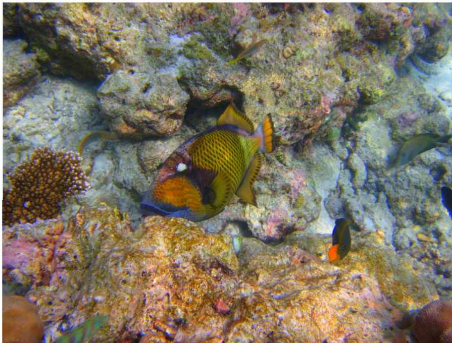
Triggerfish munching on coral. Kurumba Maldives