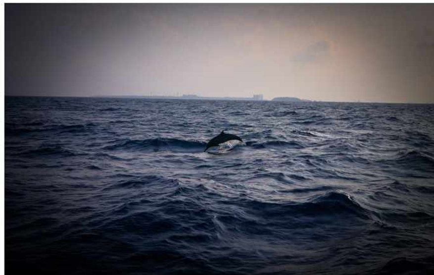
Dolphin Discovery Sunset Cruise. Kurumba Maldives