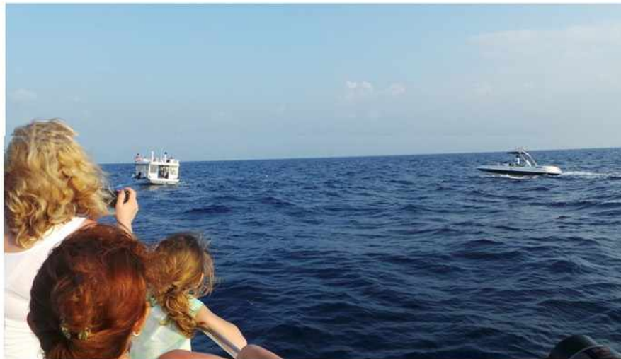
Dolphin Discovery Sunset Cruise Kurumba Maldives