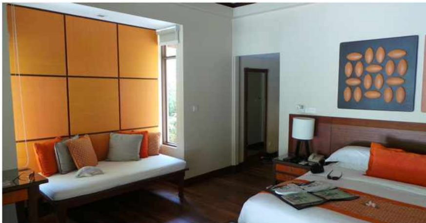
Deluxe Bungalow. Kurumba Maldives

Just a few steps away from the water, this Deluxe Bungalow was our room in Kurumba. At 74 Sqm, the bungalow has a feeling of exclusivity. The 'neighbours' are quite far away (as you can see from the distance above), and each bungalow is also assigned its own lounge chair by the beach so there's no awkward musical chair scenario among guests.