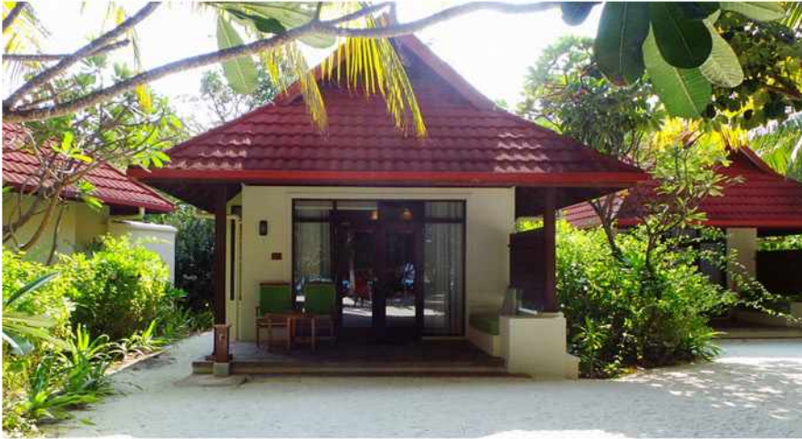
Deluxe Bungalow. Kurumba Maldives

Just a few steps away from the water, this Deluxe Bungalow was our room in Kurumba. At 74 Sqm, the bungalow has a feeling of exclusivity. The 'neighbours' are quite far away (as you can see from the distance above), and each bungalow is also assigned its own lounge chair by the beach so there's no awkward musical chair scenario among guests.