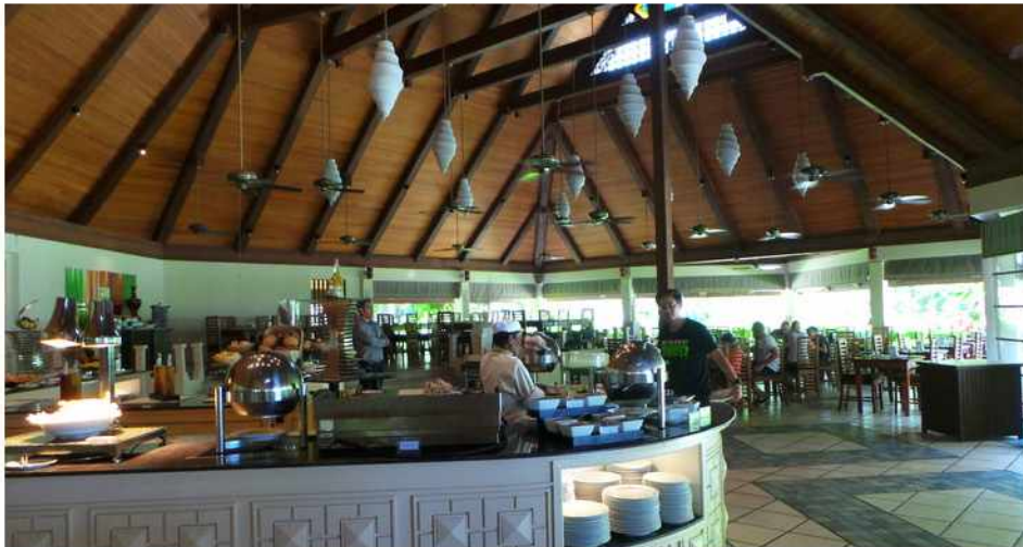
Vilhamana Restaurant. Kurumba Maldives

Most guests in Kurumba stay at the resort long term. Like 2 weeks and above kinds of stays. I don't blame them one bit, and they also won't get bored of the food as Kurumba has 8 (yes, Eight) restaurants all catering to different cuisines and tastes. They even have a Karaoke bar! (which was sadly closed when we were there)