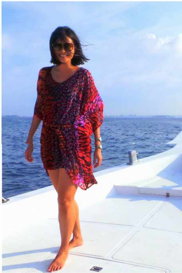
Dolphin Discovery Sunset Cruise Kurumba Maldives