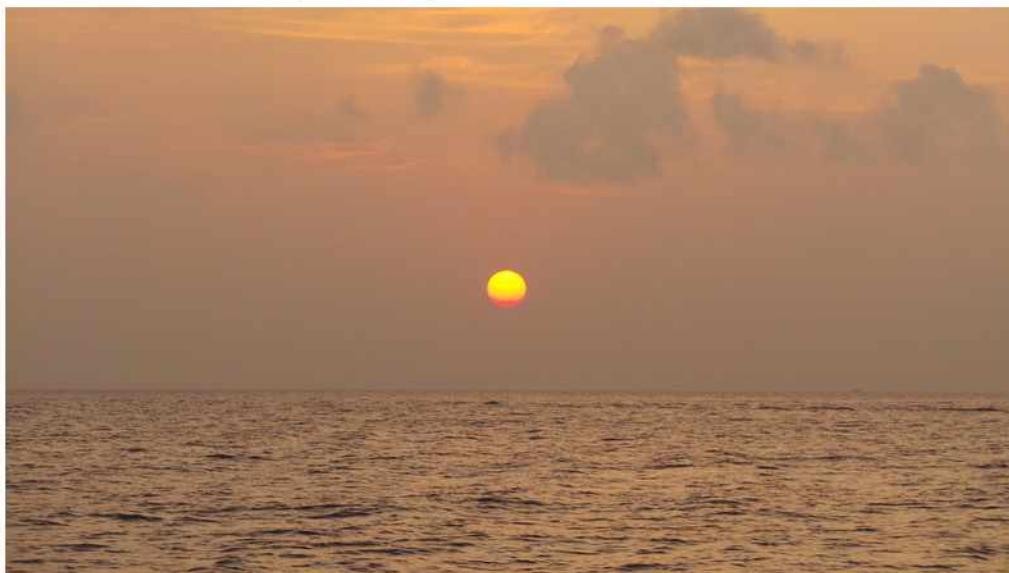
Dolphin Discovery Sunset Cruise Kurumba Maldives