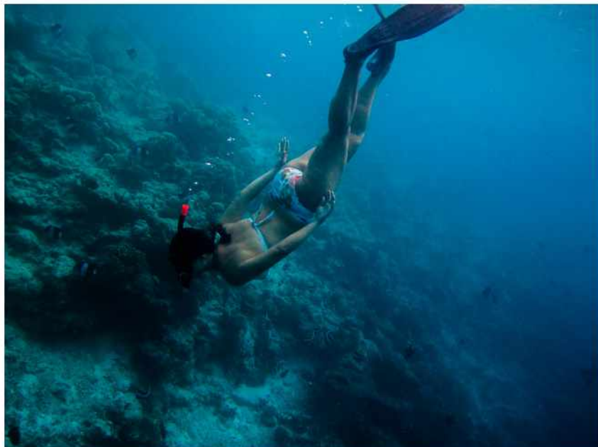
underwater scene, Kurumba Maldives