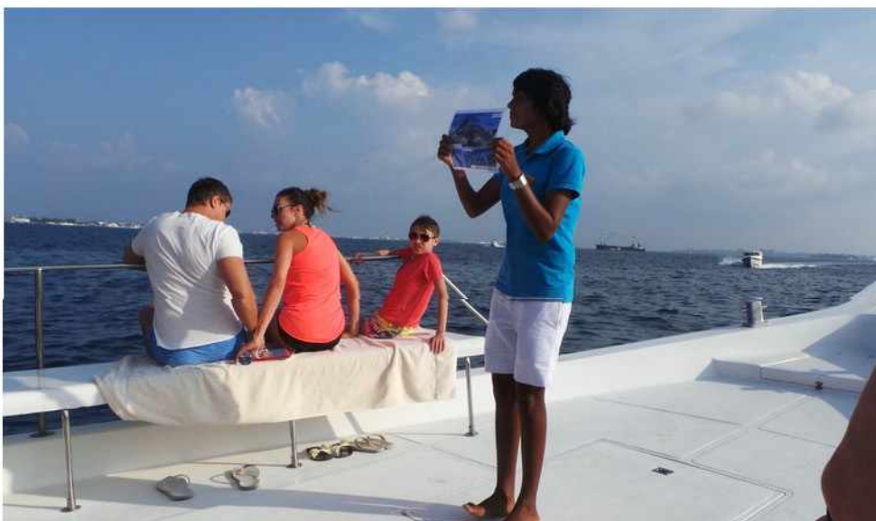
Dolphin Discovery Sunset Cruise Kurumba Maldives

There are a lot of excursions that can be done in Kurumba, and we joined the Dolphin Discovery Sunset Cruise one afternoon.