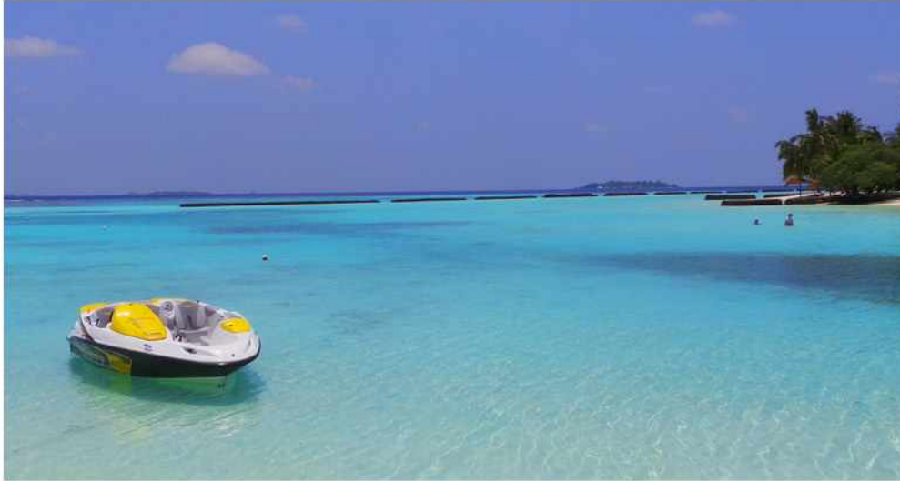
the waters of Kurumba Maldives

Because the waters of Kurumba are clear, and the house reef is very much alive.