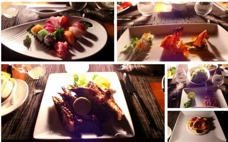
Dinner at Ocean Grill, Kurumba Maldives

I couldn't get enough of the seafood, which were all grilled in coconut charcoal – giving it that nutty, charred and wonderful taste! I also love that you can completely tailor the menu to your personal choice, choosing how your seafood or meat is cooked, and the accompanying sauce.