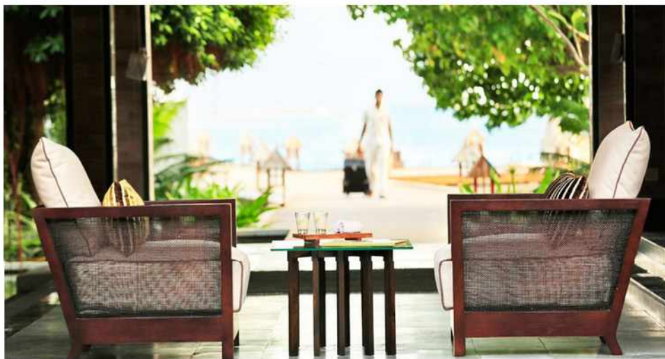
arrival in Kurumba Maldives

And really, all this for a less than 10 minute boat ride may seem extravagant. But this is Kurumba hospitality for you — timeless comfort.