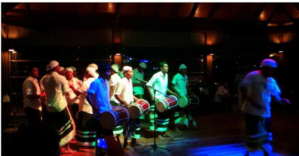
Lively Boduberu performance in Kurumba Maldives

We were able to have meals at 2 of the restaurants, Vilhamana, pictured above, where breakfast, lunch and dinner are served for the day. A lot of seafood and pasta choices, perfect for mid-day eating!