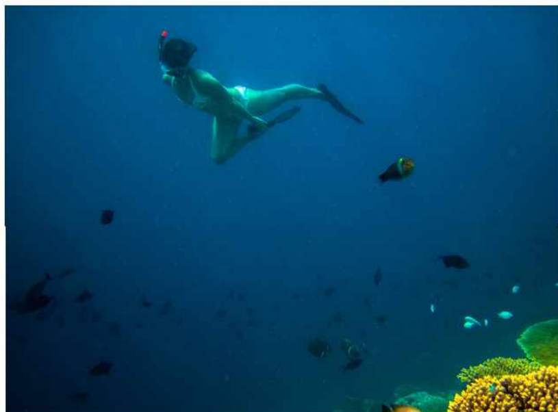
House Reef , Kurumba Maldives