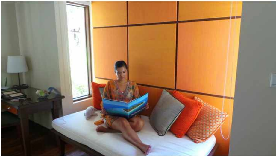
day bed / reading nook at a Deluxe Bungalow room. Kurumba Maldives

Lying on the bed are a couple of "care packs". I cannot think of a better term for them actually because they are well thought of! Slippers (and not the bedroom kind) for you to use around the resort, bag tags, mosquito bands (genius idea!), and an edition of Kurumba magazine (the hotel's own publication). The best part -your own beach bag, big enough to fit your snorkel gear, and more.