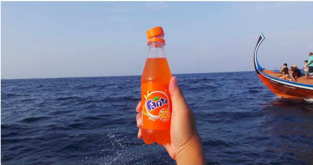
Dolphin Discovery Sunset Cruise Kurumba Maldives

I did get a bit seasick towards the end of the cruise, but nothing that a bottle of Fanta won't fix: