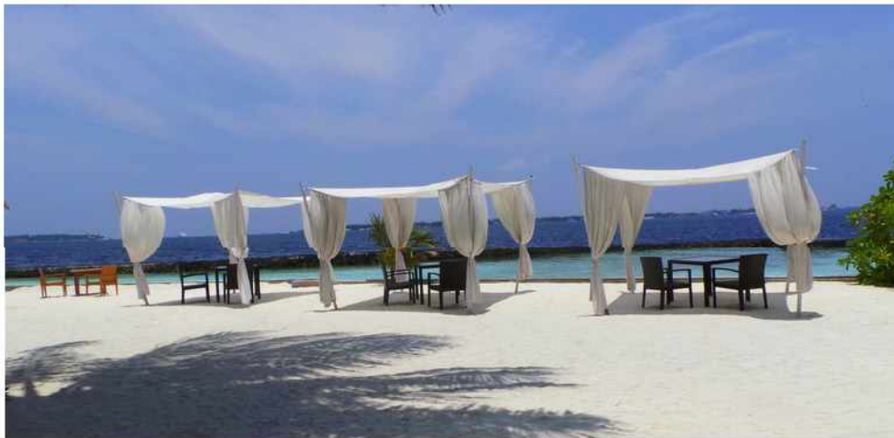
Ocean Grill, Kurumba Maldives

At night we had al-fresco dining at Ocean Grill (above), which I highly highly recommend. Fresh off the grill seafood by the beach – this is how dinner is done right in the Maldives.