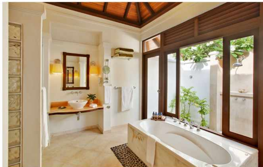
Deluxe Bungalow Bathroom. Kurumba Maldives

The bathroom gave a feeling of walking into a small spa. 2 sinks, a stand alone bath tub and 1 outdoor shower, and 1 indoor.