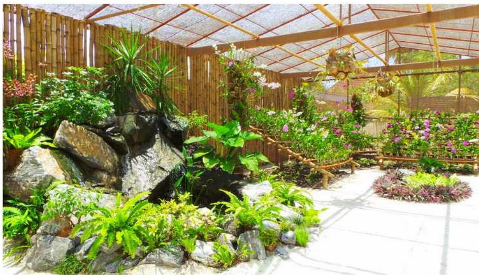
Kurumba Orchid Greenhouse

Kurumba has a very homey and 'residence-y' feel without losing its exclusivity. The resort was in full capacity when we were there, yet we barely felt it. With 8 restaurants, a myriad of activities to do, and the endless playground that is the sea, there is much to do for everybody in Kurumba.