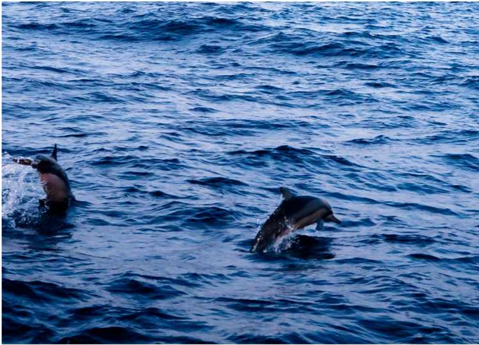
Dolphin Discovery Sunset Cruise Kurumba Maldives

It's really fascinating to watch and witness dolphins in their natural habitat. They were jumping and spinning not under someone's command or for a reward, but this is what they really do. This is their home, and we were just visitors.