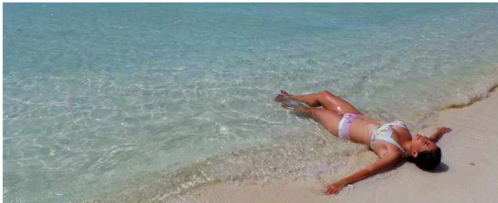
Beach in Kurumba Maldives. Swimwear by JETS