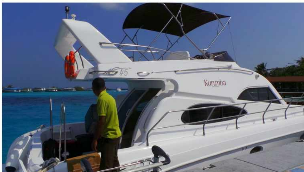
Kurumba Speedboat on arrival. Male Airport