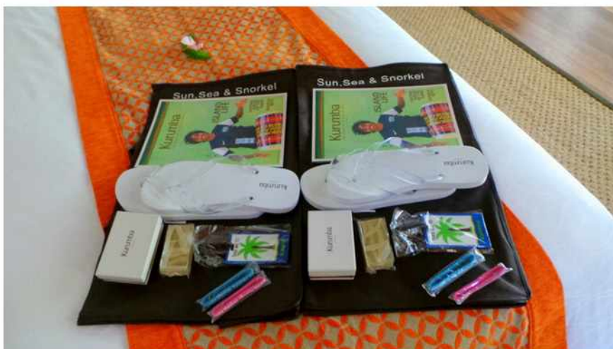
'care' pack for guests in Kurumba maldives

There's something comforting and fuzzy about warm tones, oranges and yellows. It just made me feel like this is home and I should kick back and relax.