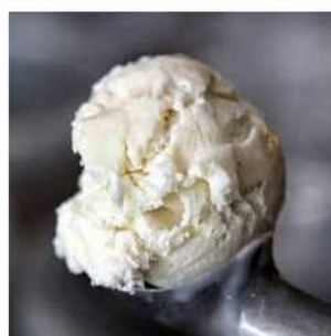
Coconut Ice cream

Welcome drinks are 'so last season' in Kurumba island. They've brought in the best welcome treat I've ever had the pleasure of receiving.