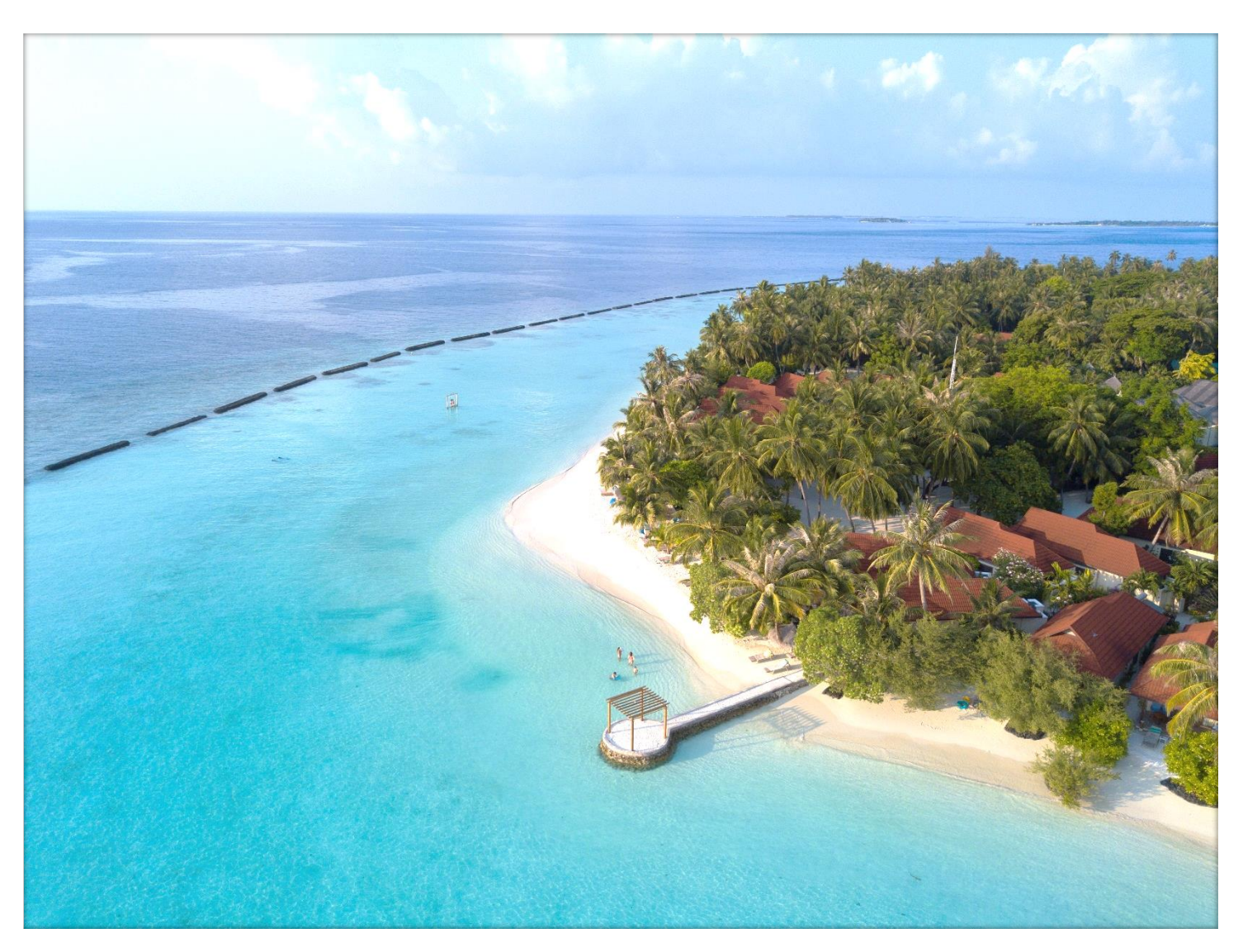
Just moments away from the final countdown, we welcome you to our 32nd issue of Kurumba's Newsletter