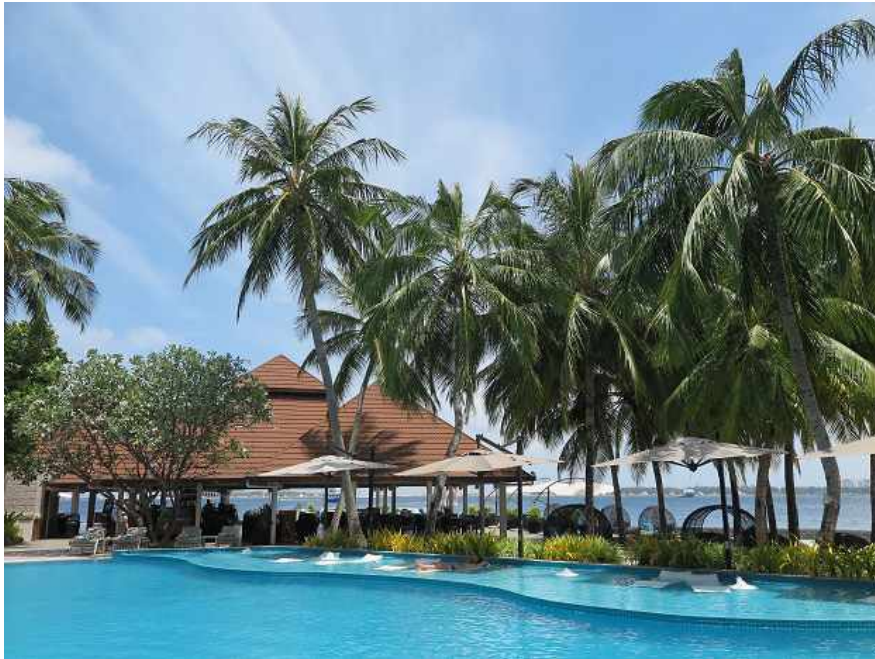
The main swimming pool in Kurumba Maldives