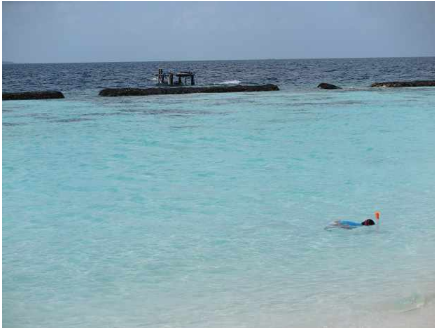
Snorkeling in the lagoon is one of the popular activities in Kurumba Maldives.