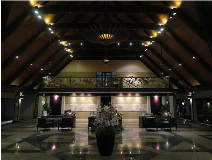
Kurumba Main Lobby