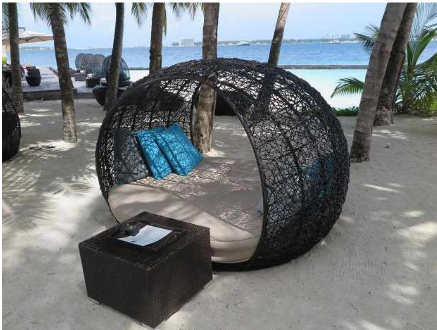
A relaxing spot under the Kurumba coconut grove.